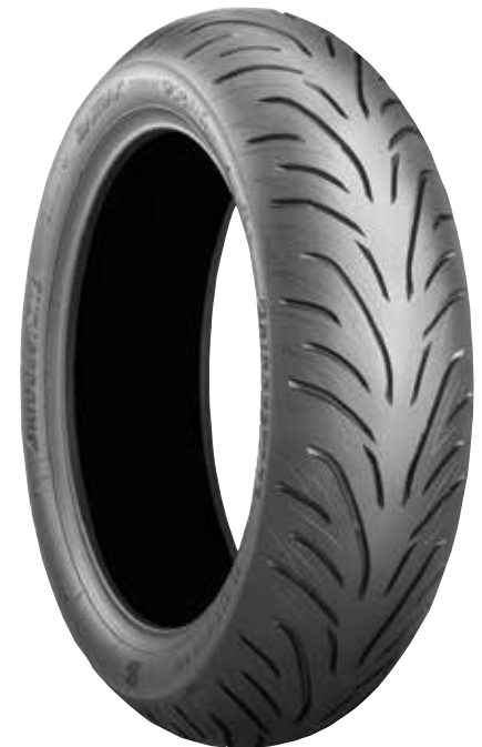
Battlax SC2 Rain Scooter Rear