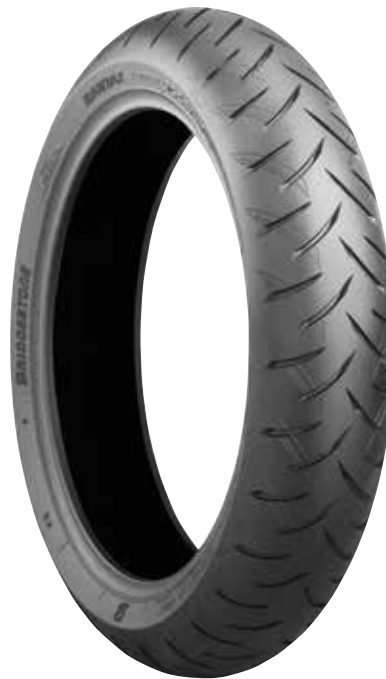
Battlax SC2 Scooter Front