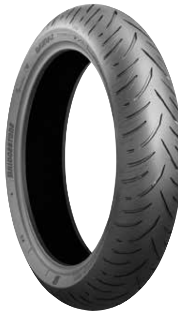
Battlax SC2 Rain Scooter Front