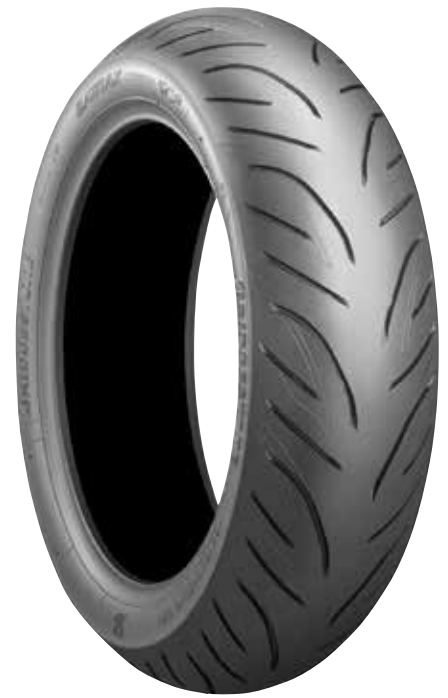
Battlax SC2 Scooter Rear