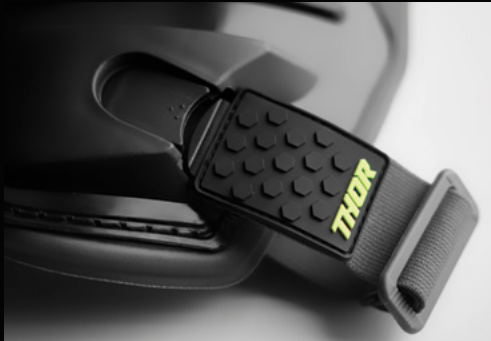
⑤ Adjustable elastic closure with ratcheting buckle.