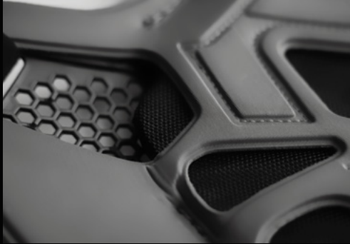
① Impact foam positioned at chest and back.