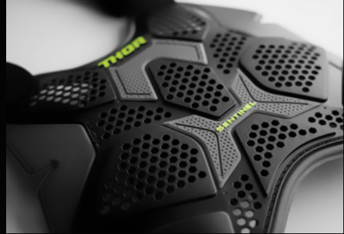
② Lightweight low-profile front and back panel design.