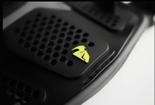
⑧ Back protector tested and certified according to European Standard EN 1621-2:2014, Level 1.