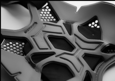
③ Press-Fit molded and ventilated comfort liner system.