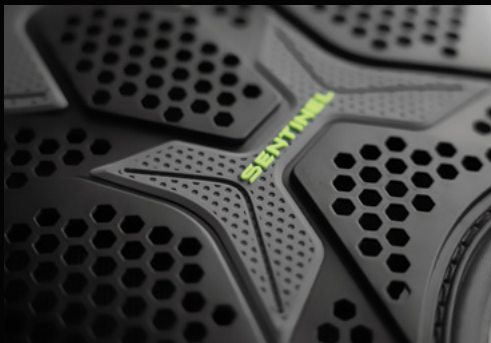
⑦ Chest protector tested and certified according to European Standard EN 1621-3:2018, Level 1.