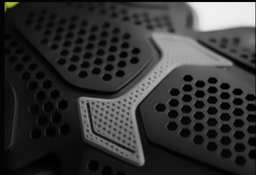
④ Abundantly placed ventilation ports for maximum cooling.