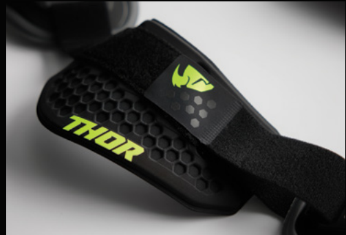
⑥ Adjustable shoulder straps and adjustable/removable shoulder pads allow rider custom fit and feel.