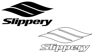
6" Die-cut Decal