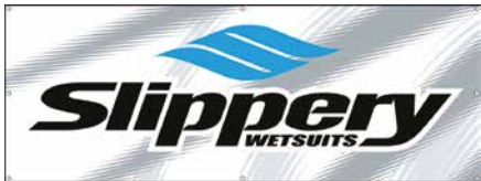
3' x 8' Banner