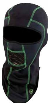
PRO STRETCH PLUS BALACLAVA