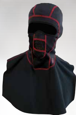
WINDSHIELD® PSP BALACLAVA W/DICKIE