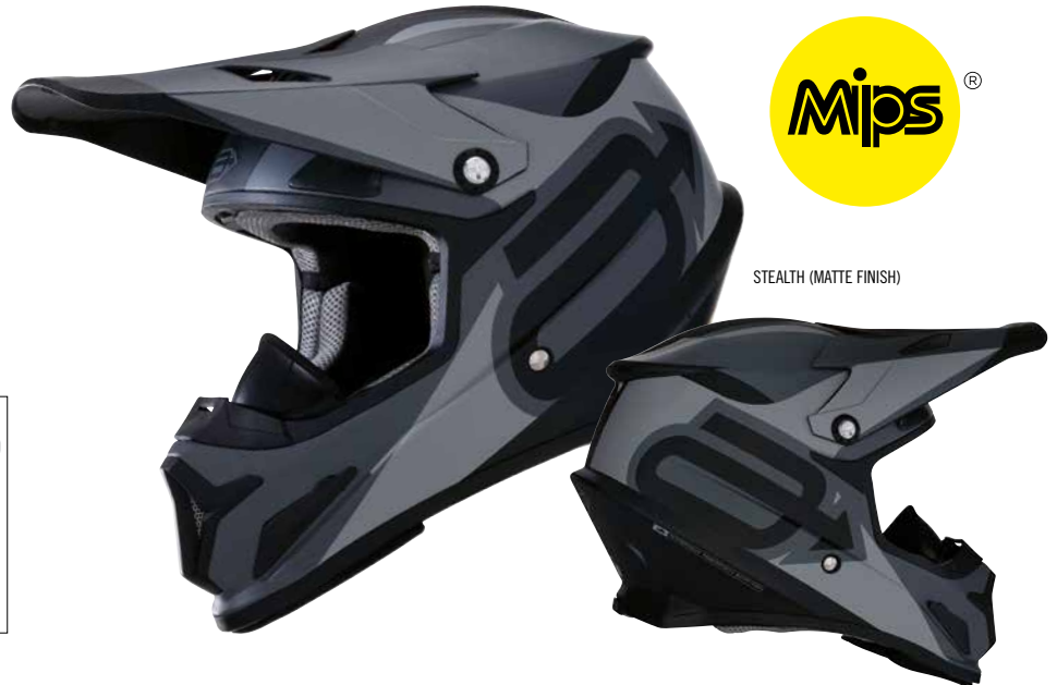
STEALTH (MATTE FINISH)