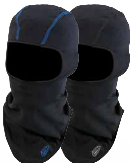
DRI-RELEASE LINER GUARD