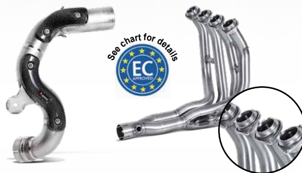
1 Evo Track Day Link Pipe.